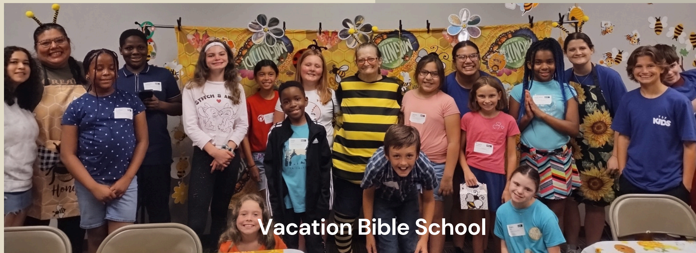
Vacation Bible School