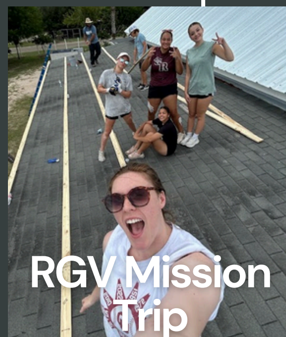
RGV Mission Trip