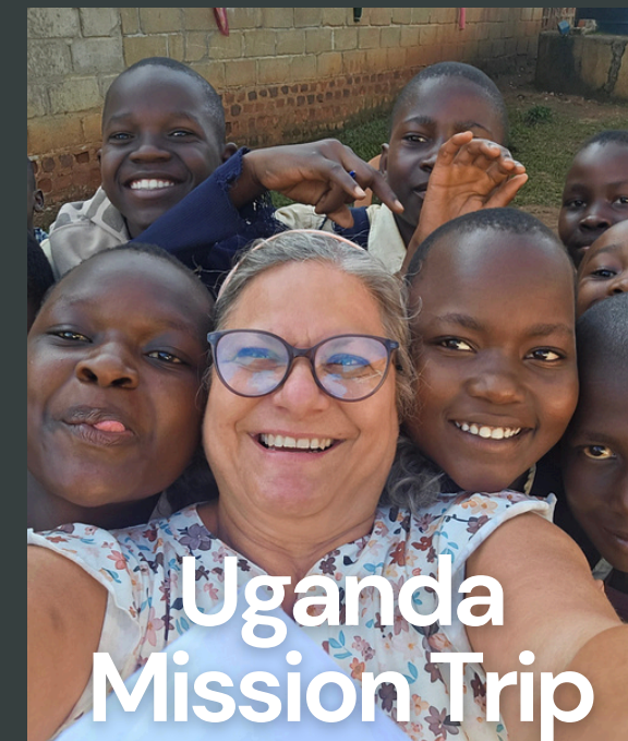
Uganda Mission Trip