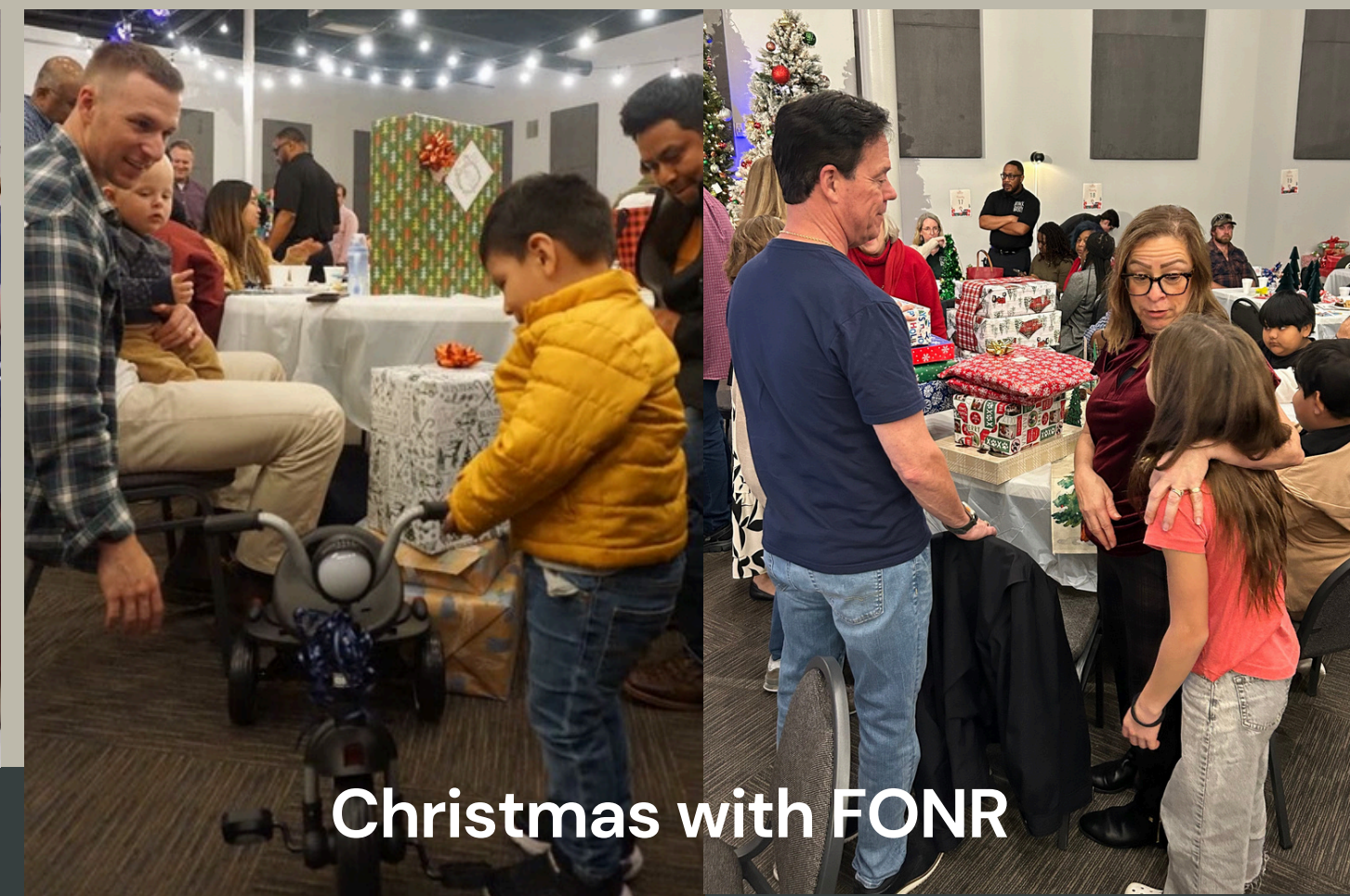
Christmas with FONR

We want to reach as many people as possible in our local community with the gospel and with the incredible work that God is doing at TSF. Through our VBS, Fall Festival, and Christmas season events, we have direct outreach to over 150 people and families that are seeking a church home. The follow up is on-going, and know that your generosity makes this kind of local outreach a reality!