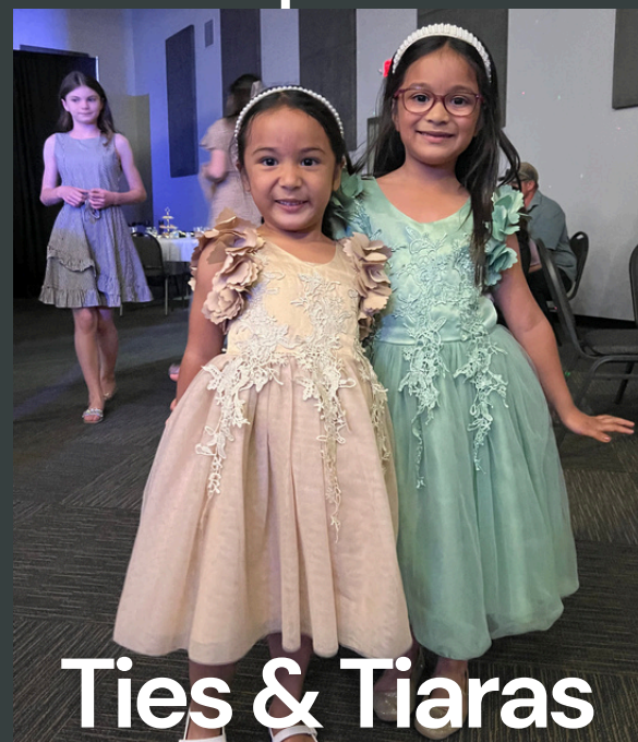
Ties & Tiaras