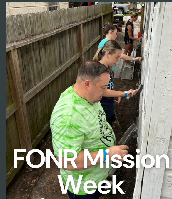
FONR Mission Week