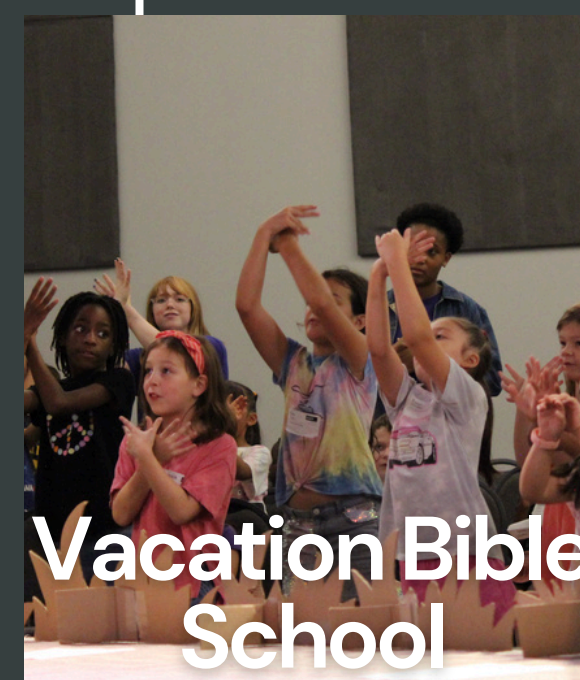
Vacation Bible School