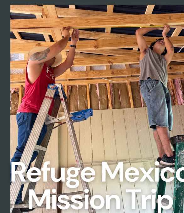
Refuge Mexico Mission Trip

There have been hundreds of people and families involved with TSF ministries and events this year.