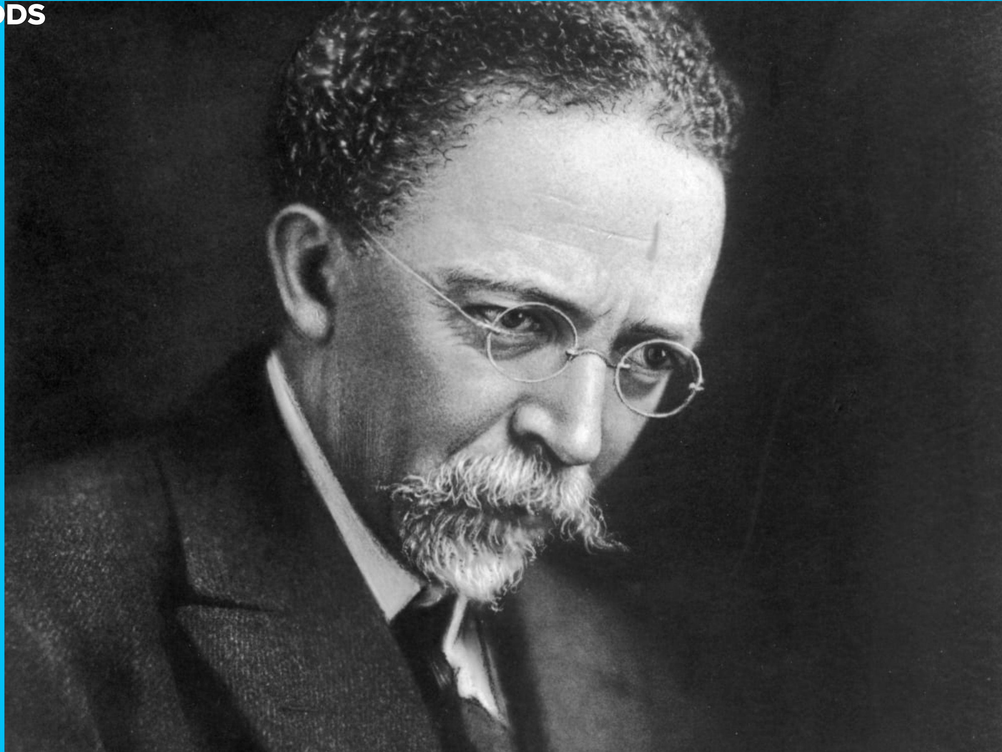
Henry Ossawa Tanner (1859-1937)